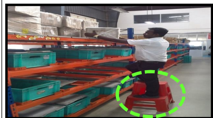
BEFORE AFTER KAIZEN SUSTENANCE

WHY - WHY ANALYSIS:- WHY 1 – No safety when doing loading & unloading of hard to access material. WHY 2 – By pass safety. WHY 3 - Not using stool when doing loading & unloading of hard to access material.